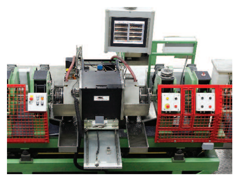
-Echomac® electronics installed with an Echomac® rotary transducer unit to test stainless steel and titanium alloy tube used in heat exchangers.