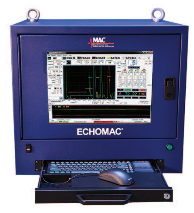
Echomac Instrument housed in a CAB 002 Environmental Cabinet